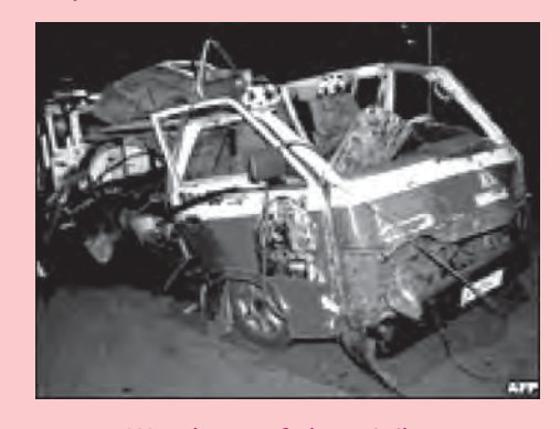
Wreckage of the minibus